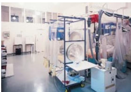
Top - Hereford Hospital Mortuaries, UK Bottom - Coppetts Wood Isolation Hospital, UK