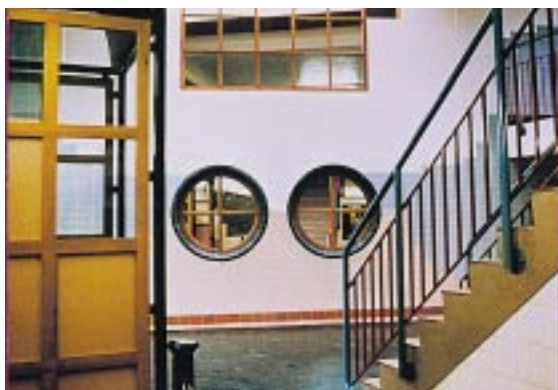
Top - Housing Estate Stairwell subject to severe graffiti abuse Bottom - Subsequent refurbishment using Armourlac