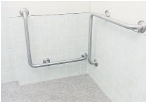
Top - Inmarsat, London Bottom - Shower Area Refurbishment, Tokyo