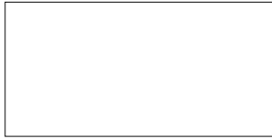
9003 Snow White