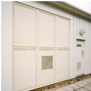
C/S Explovent® Explosion Venting Systems