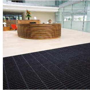
C/S Pedisystems® Entrance Matting Systems