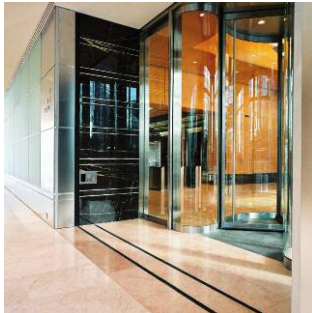
C/S Allway® Expansion Joint Covers