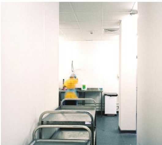
Trim jointing in the hospital kitchen corridors