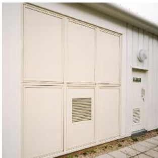
C/S Explovent® Explosion Venting Systems