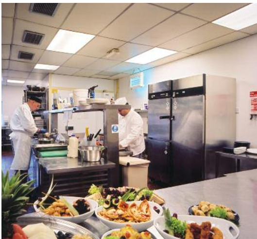
Mastic joints in a busy commercial kitchen