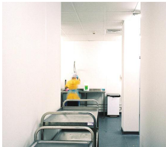
Trim jointing in the hospital kitchen corridors