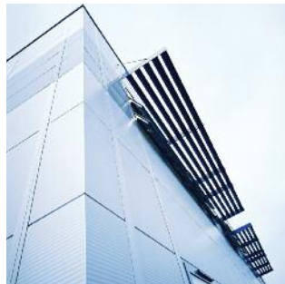
C/S Airfoil® Solar Shading Systems