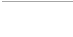
9003 Snow White