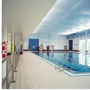
C/S Wallglaze® Specialist Coatings for Walls and Floors