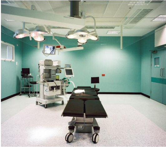
Welded joints in the operating theatre environment

Acrovyn® Hydroclad smooth wall cladding provides an impervious hygienic and impact resistant surface for internal walls. It is particularly suitable for hygienically sensitive areas such as food processing and preparation areas, laboratories, medical and surgical facilities, which require a smooth, seamless and easy to clean surface. Acrovyn Hydroclad is easy to install and with several jointing options, there is a solution for all technical requirements.