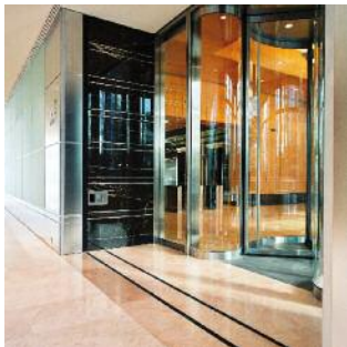
C/S Allway® Expansion Joint Covers