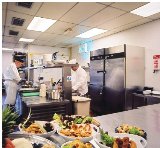
Mastic joints in a busy commercial kitchen