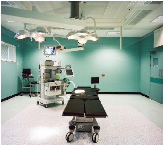
Welded joints in the operating theatre environment

Acrovyn® Hydroclad smooth wall cladding provides an impervious hygienic and impact resistant surface for internal walls. It is particularly suitable for hygienically sensitive areas such as food processing and preparation areas, laboratories, medical and surgical facilities, which require a smooth, seamless and easy to clean surface. Acrovyn® Hydroclad is easy to install and with several jointing options, there is a solution for all technical requirements.