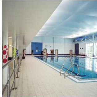
C/S Wallglaze® Specialist Coatings