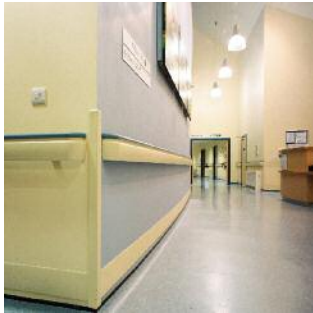
C/S Acrovyn® Wall, Door and Corner Protection