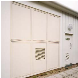
C/S Explovent® Explosion Venting Systems