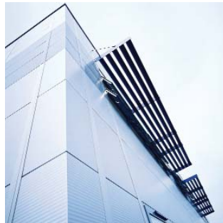
C/S Airfoil® Solar Shading Systems