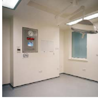
C/S Wallglaze® Specialist Coatings for Walls and Floors