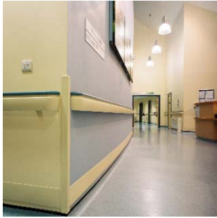
C/S Acrovyn® Wall, Door and Corner Protection