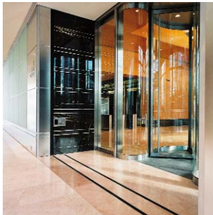
C/S Allway® Expansion Joint Covers